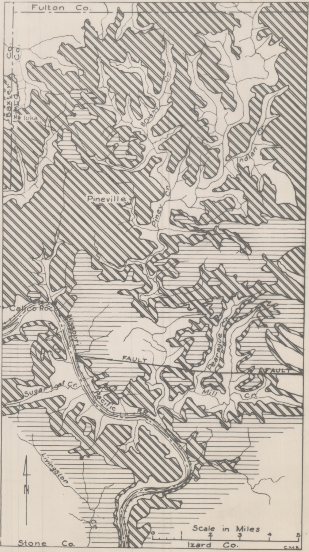
SKETCH MAP SHOWING DISTRIBUTION OF CALICO ROCK SANDSTONE IN THE VICINITY OF CALICO ROCK IN SOUTHERN IZARD AND NORTHERN STONE COUNTIES.